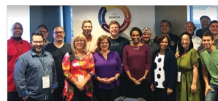
We partnered with Covenant Offices colleagues in our new coaches training program.

IFFEC is composed of church federations from the Free Church heritage in 33 countries. They meet for mutual support, cooperation in mission, and to help member federations develop healthy churches.