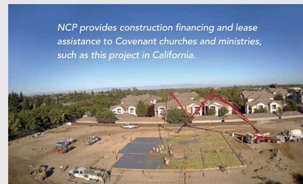
NCP provides construction financing and lease assistance to Covenant churches and ministries, such as this project in California.

NATIONALCOVENANTPROPERTIES.ORG Watch our 50th anniversary video and interview with the four presidents of NCP and to learn more about our ministry.