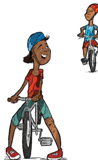
Justice Journey for Kids

Youth workers across the entire ECC have done an incredible job of caring for the younger generation of Covenanters during the Covid-19 pandemic. They have led the church in developing creative ways for youth to connect even during “shelter in place.”