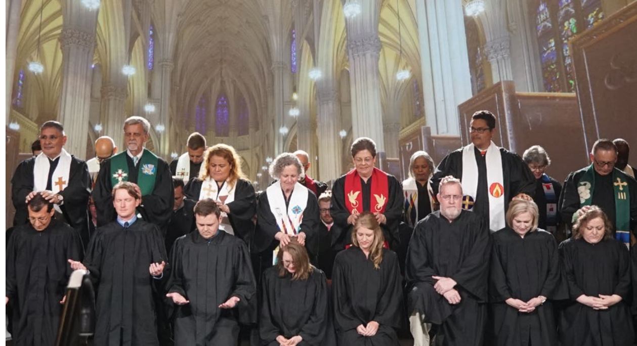
The cancellation of Gather 2020 meant the cancellation of the ordination service. We envision an ordination service in 2021 with nearly 100 ordinands as we combine the ordination classes of 2020 and 2021.

lives of ECC clergy. Our vision is to be present with our pastors to the best extent possible and be prepared to resource them with opportunities for personal leadership and spiritual growth.