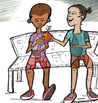
Justice Journey for Kids

For the first time ever, we had 40 Covenant pastors and credentialed leaders participate in Sankofa, one of our