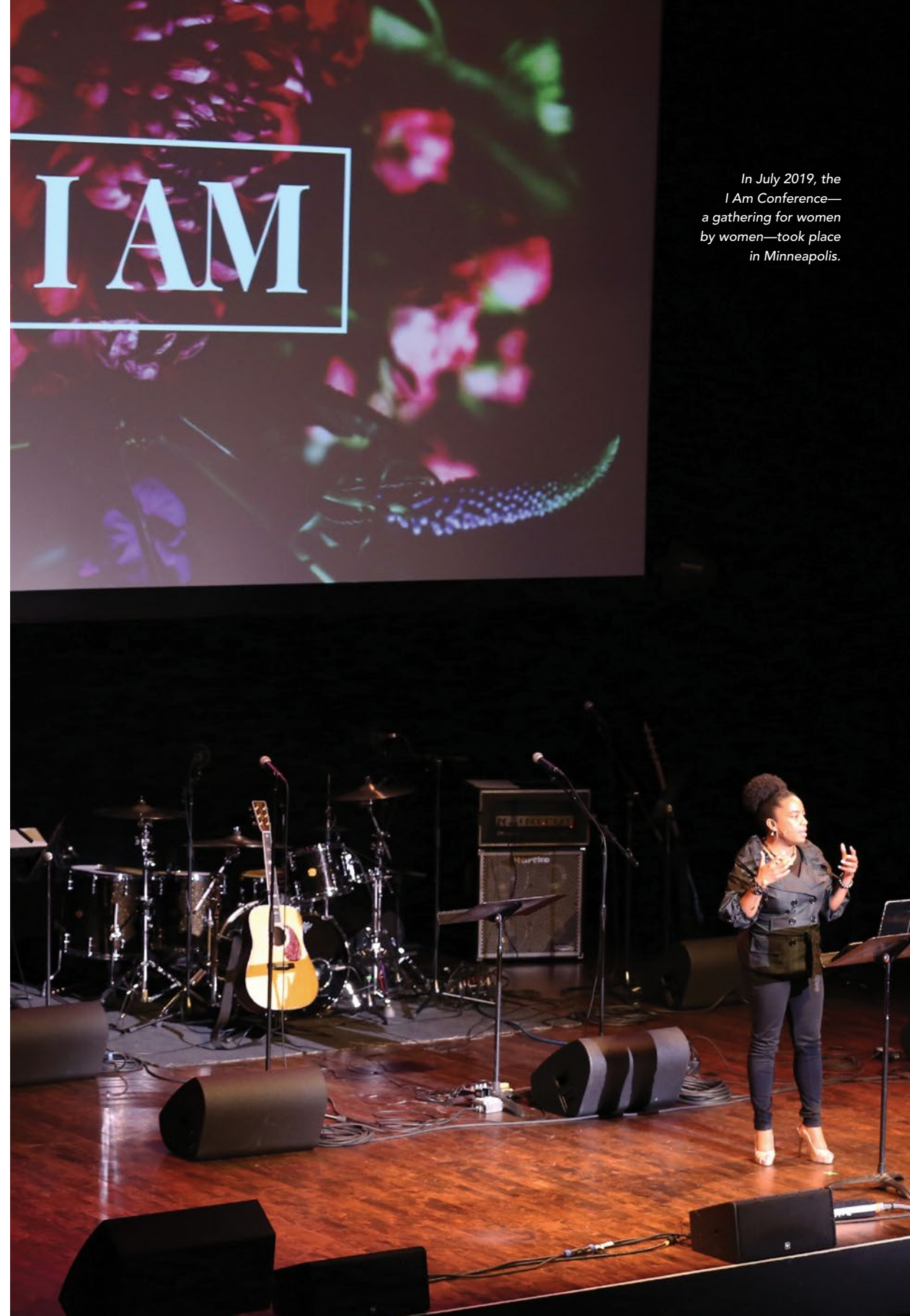
In July 2019, the I Am Conference—a gathering for women by women—took place in Minneapolis.

As members of the body of Christ, we seek to collaborate with the whole church to create an environment conducive for the development of kingdom efforts and impact.