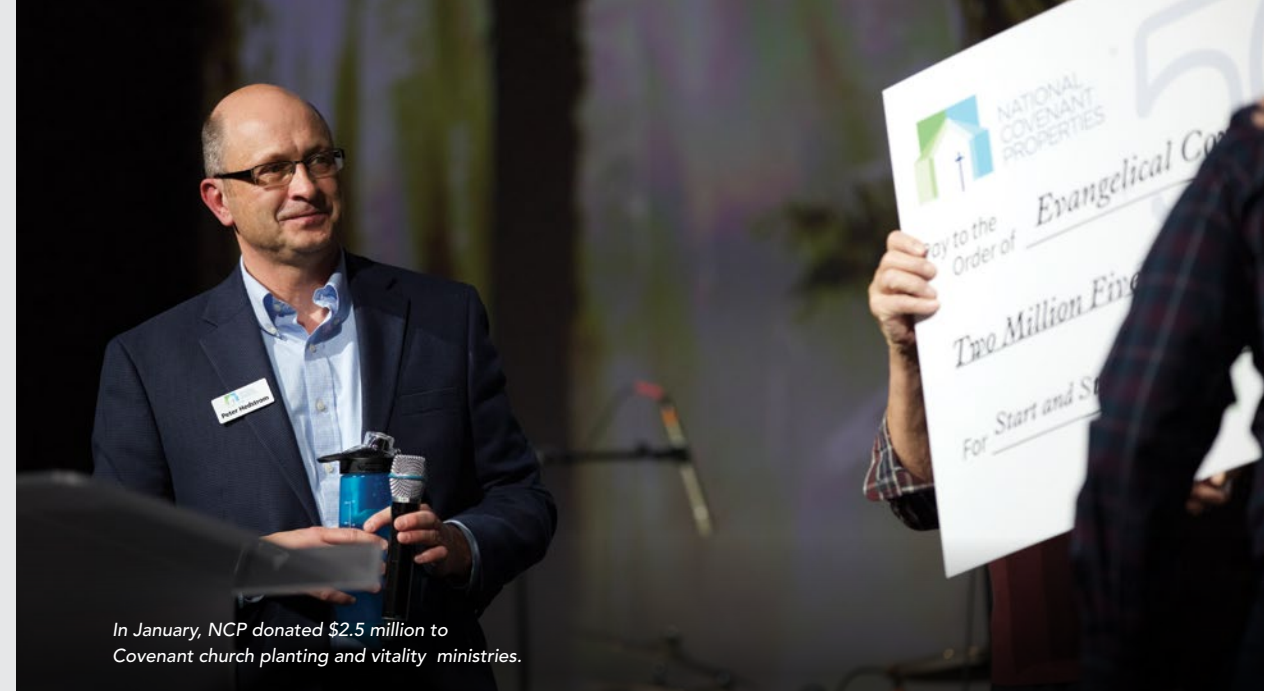
In January, NCP donated $2.5 million to Covenant church planting and vitality ministries.

The NCP staff helps churches and project leaders identify land and facility options, negotiate leases and real estate purchases, construct and expand current facilities, as well as sell and lease out current church properties.